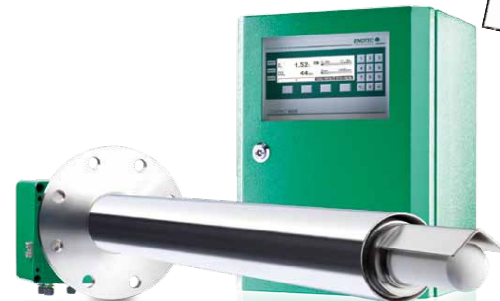
SME-53 electronic unit and KES-6002 probe (immersion depth 930mm)