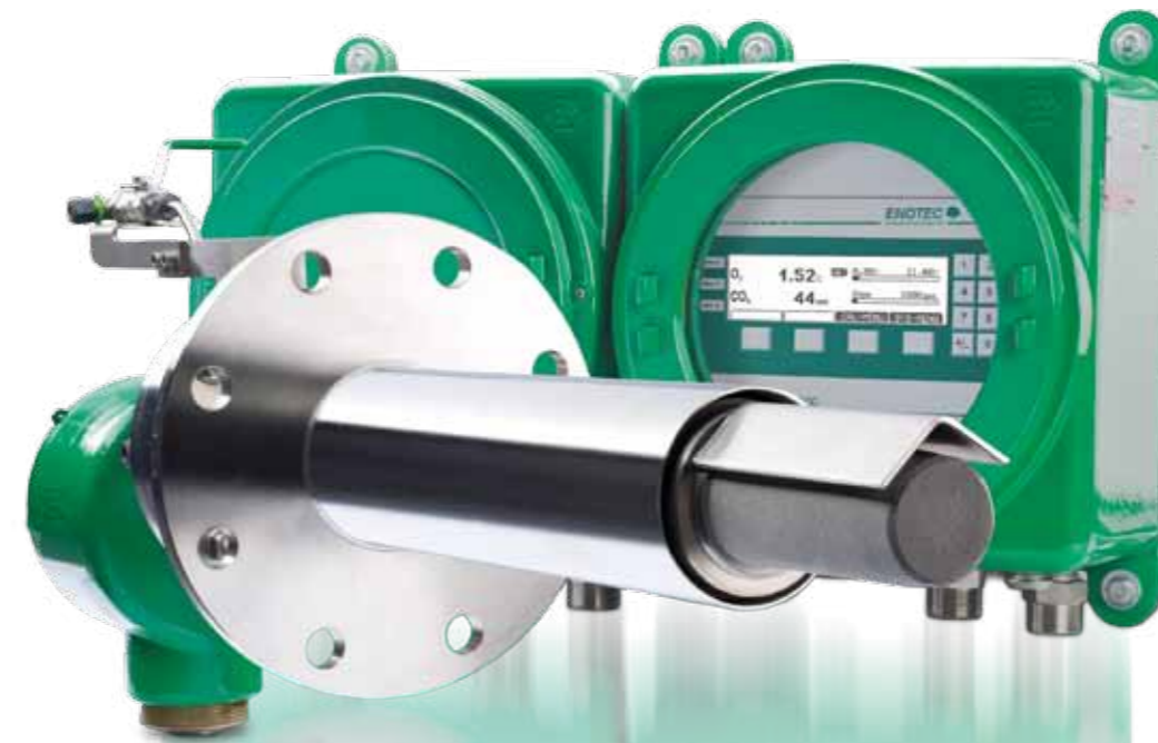
ATEX certified SME-5D electronic unit and KEX-6001 probe (immersion depth 470mm)

II 2G Ex d IIC T3 Gb (probe) II 2G Ex d IIC T6 Gb (electronic unit)